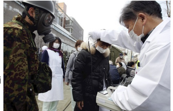
Scientists check residents near the damaged Fukushima Daiichi nuclear power plant for radiation. Four nuclear reactors at the plant were damaged by last week's massive earthquake and tsunami.

In nuclear reactors, atom-splitting takes place in the extremely hot, radioactive core, which is protected by several layers of steel and other sturdy materials.