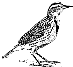
State Bird Western Meadowlark

This is the last state listed when all 50 states are put in alphabetical order.